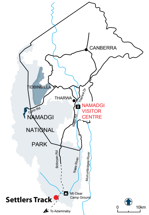
Map of Namadgi National Park and the location of the Settlers Track