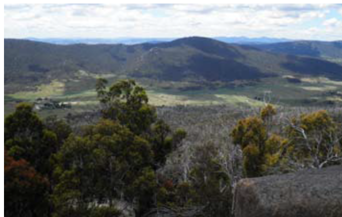
Orroral Valley (above) and granite boulders (below) from the end of the track.

The Granite Tors track starts from the Cotter Hut Road/Orroral management trail, initially passing through Snow Gum, Black Sallee, tea tree and Snowgrass. As you climb, the forest changes to Ribbon Gum, Mountain Gum, Candle Bark and Broad-leaved Peppermint.