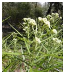
Alpine Rice Flower (above left) Fringe Lily (above right), Dogwood (left)

At the lookout, stay behind the barrier as there is a steep drop beyond.