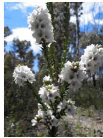
Austral Bugle (left) and Drumstick Heath (right)